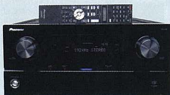
MULTICHANNEL RECEIVER PIONEER SC-LX81

Pioneer's 50in plasma is the perfect focal point for this system. It's one of the finest flatscreens that money can buy and delivers a truly stunning picture. Go to p50 for the full review.