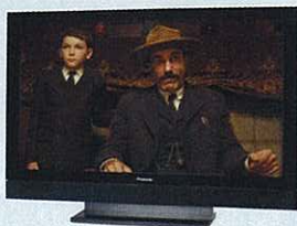
PLASMA TV PIONEER PDP-LX5090