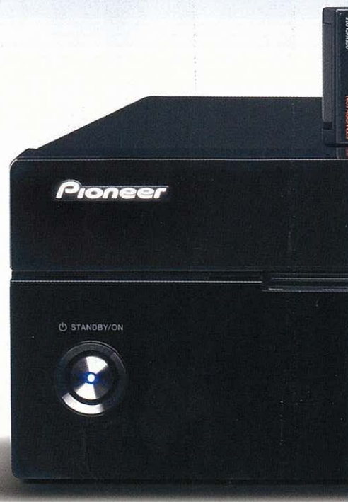
Pioneer is as comfortable with high-quality visuals as it is with stunning music

But, niggles aside, this is an extremely talented Blu-ray player whose positives far outweigh any negatives. Spin a disc and you're guaranteed a picture that sounds just as fabulous as it looks.