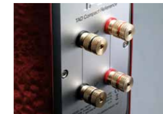
Large machined speaker terminals