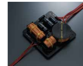
Crossover networks (Bass driver)