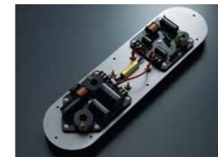
Crossover networks (CST Driver)