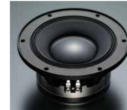
Bass driver unit

The bass driver was designed to achieve total linearity of the magnetic circuit, diaphragm and suspension. The magnetic circuit features our unique short voice coil OFGMS (Optimized Field Geometry Magnet Structure). With a long gap of 20mm (0.8 in.), it linearizes the magnetic flux density along the gap. This stabilizes drive performance from small to large amplitudes, achieving high linearity and consistently accurate waveform reproduction. The TLCC (Tri-Laminate Composite Cone) aramid diaphragm has a triple-laminated construction that provides near ideal physical properties. It delivers rich and clear low-bass with a mid-bass free of coloration. The suspension system employs TAD's traditional corrugated edge, further contributing to the high linearity.